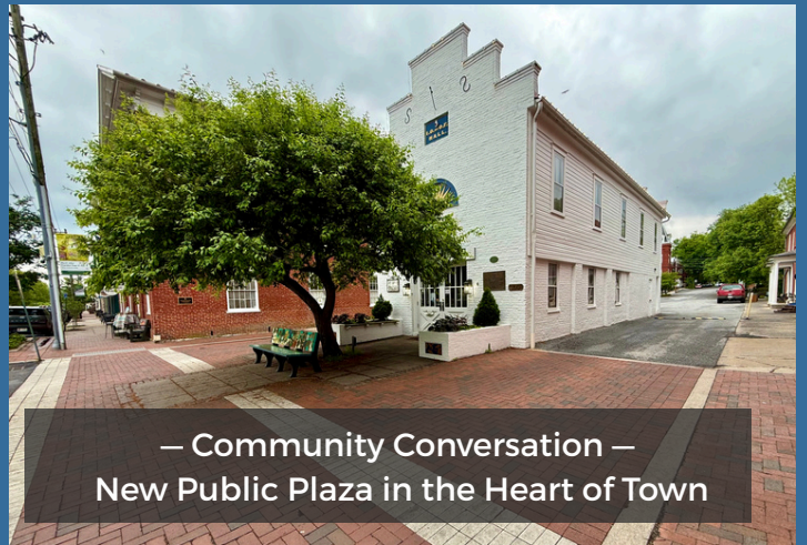
— Community Conversation — New Public Plaza in the Heart of Town

The Town will host a community conversation on Thursday, May 21, at 6:30pm to share ideas and gather input on a potential new public space/plaza downtown near the Market House.